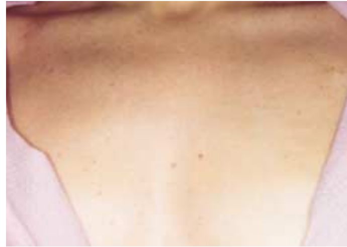
One month after one pulsed-light treatment