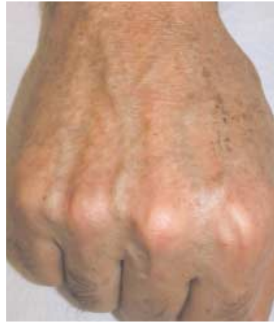
One month after one pulsed-light treatment