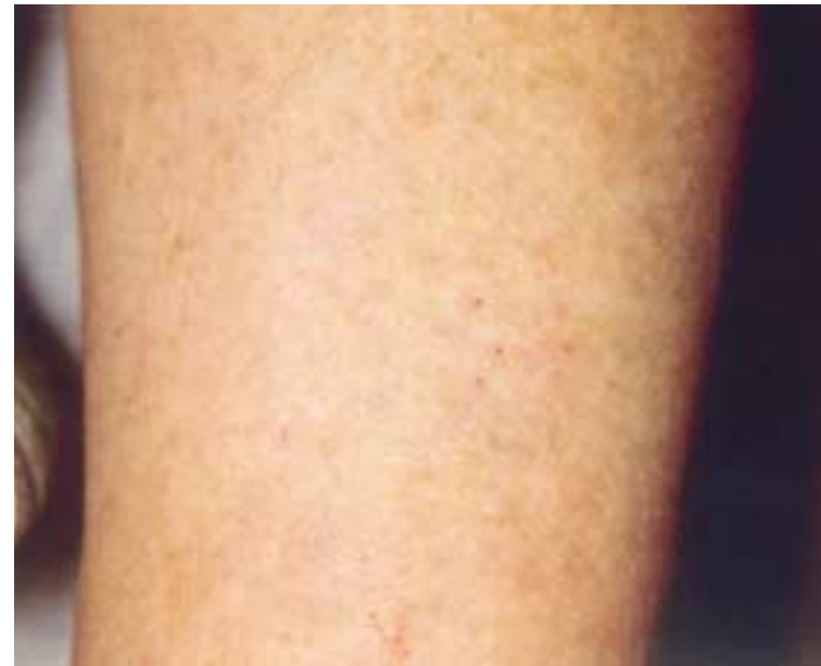
One month after one pulsed-light treatment